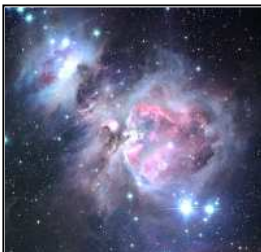
Deep Sky - M42

If you would like to view all the Section entries, they can be found in PDF format as downloadable photo albums on the AAS website www.astronomy.org.nz A photo album for the winning entries can be found on RASNZ website www.rasnz.org.nz