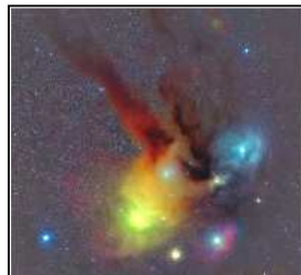
Artistic - Antares Region