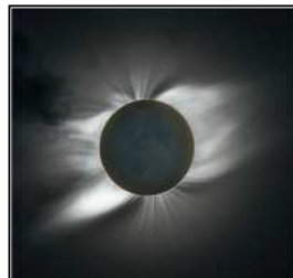
Solar System - Solar Corona