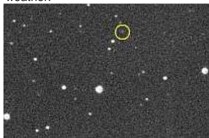
Discovery image of SA12009